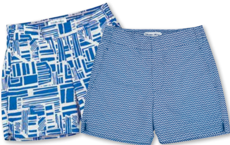
On the beach or poolside, FRESCOBOL CARIOCA's Classic Linha and Cocacabana prints make a splash. frescobolcarioca.com