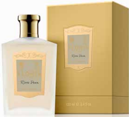
With only 200 bottles released, River Dawn eau de parfum from FLORIS evokes the Avon as it flows through the English countryside. florislondon.com