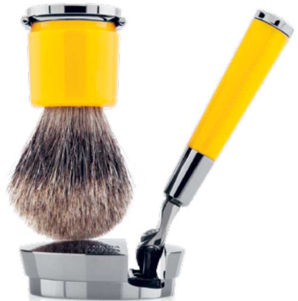
The deluxe stainless steel stand by ACQUA DI PARMA holds the ergonomic razor and soft-bristle brush of the Barbieri collection. acquadiparma.com